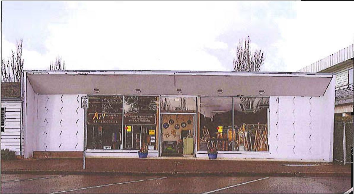
Front of the building when the Art Connection was in this location