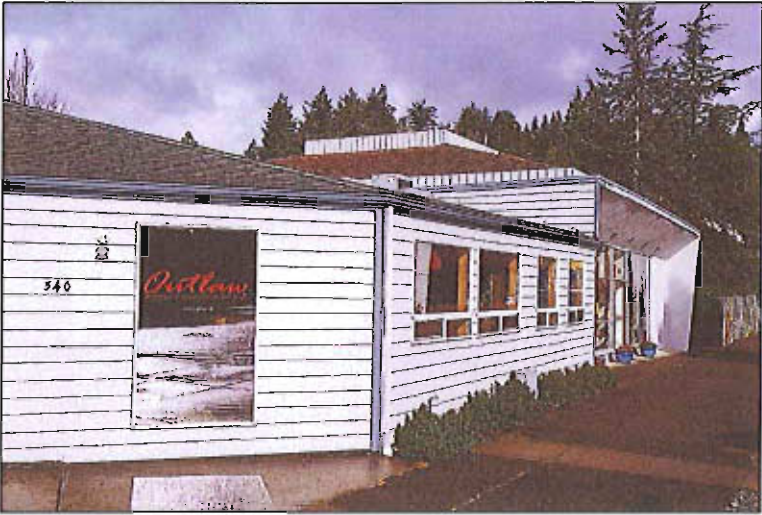
Partial view of the adjacent building. Location of Outlaw Photography