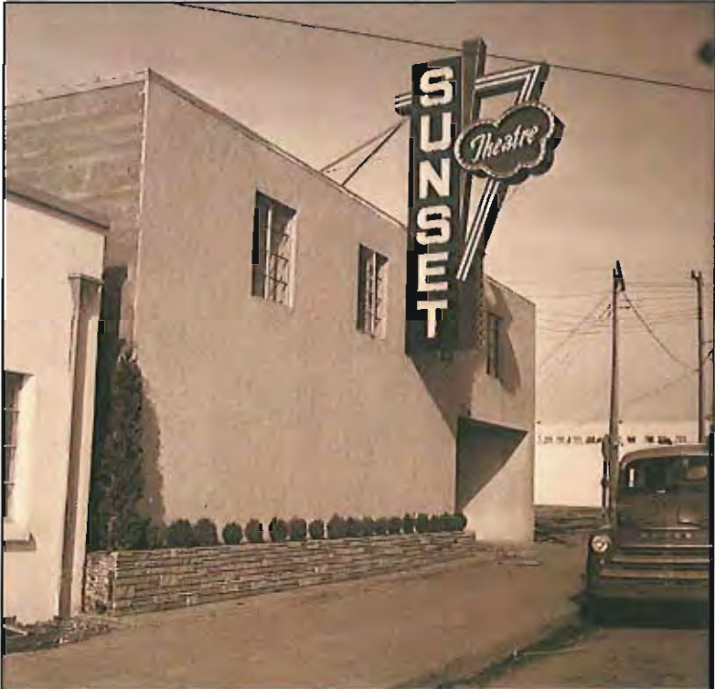
Sunset Theatre 1949-1952