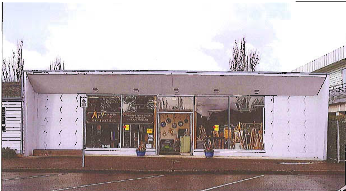
Front of the building when the Art Connection was in this location