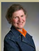
Mayor Crystal Shoji