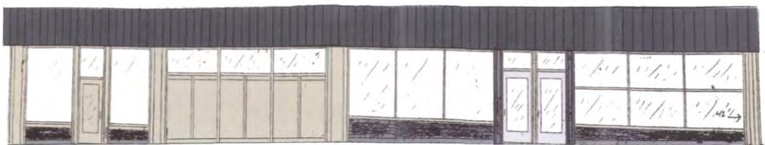
EMPIRE MERCANTILE ...Building Color Concept