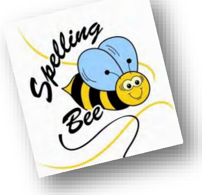
The Coos Bay Public Library Foundation's 4<sup>th</sup> Annual Adult Spelling Bee is just around the corner. The event is scheduled for Saturday, April 2nd at 7pm at the Black Market Gourmet.