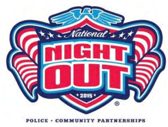
Just a few of the attractions this year are Jump for Fun, R.E.A.C.H Helicopter, ODOT Crash Car, ODF&W Boat as well as Fire Trucks and Police Cars. As in the past, there will be lots of games for the kids and adults as well. Food and drink providers will be busy in the free food court keeping the crowds fed and hydrated as they participate in the many activities provided.

NATIONAL NIGHT OUT IN THE PARK 2015 - Public Safety agencies, community groups, businesses, and neighborhoods all working together to make this event possible and provide safer neighborhoods in Oregon's Bay Area. This year's National Night Out will be held on Tuesday, August 4th in the Ferry Road Park in North Bend. The fun begins at 5:00 pm. This event is co-sponsored by the Public