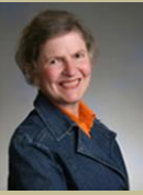
Mayor Crystal Shoji