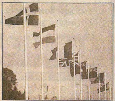
The flags on the waterfront are being labeled Saturday.