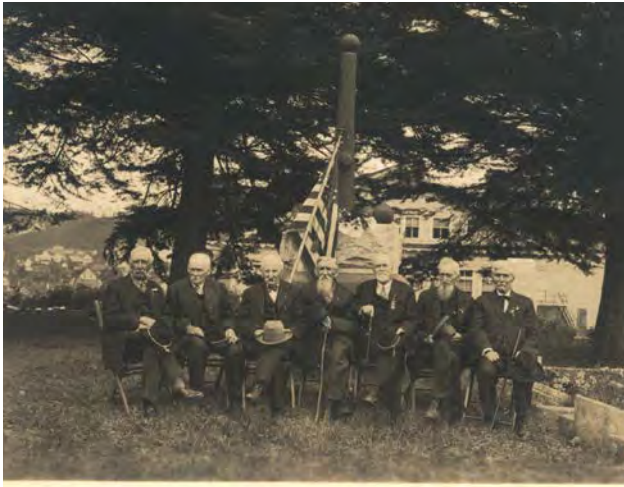
Photo of the seven oldest Civil War veterans at the Marshfield I.O.O.F. Cemetery, G.A.R. State Convention, 1926