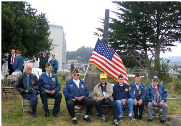
Photo of the seven oldest veterans attending the Marshfield Pioneer Cemetery Memorial Day Ceremony, 2005

One of the unique features in the Marshfield I.O.O.F. Cemetery is the 10-foot tall Civil War monument. This monument was constructed locally and consists of a 4-foot tall base of cast concrete topped with a 4-foot square block of gray granite. An 1861, 3-inch ordnance rifle is set vertically in the granite with five ft. of the barrel exposed. Originally, the ordnance rifle was topped by an 8 in. seacoast Howitzer ball, and a Howitzer ball was located at each corner of the granite block; only two of the projectiles remain.