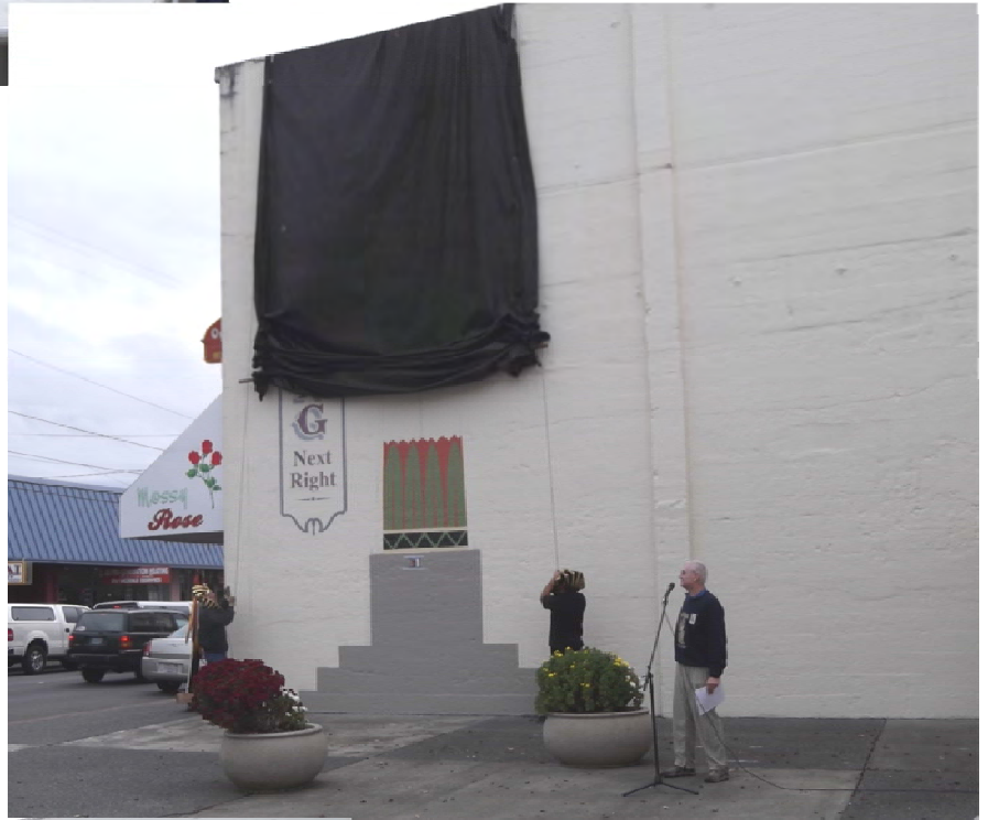
Unveiling of the obelisk fund- raising thermometer