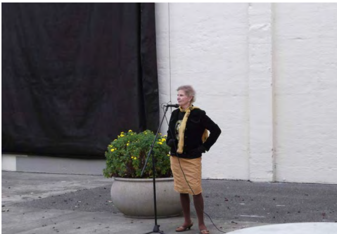
Mayor Crystal Shoji