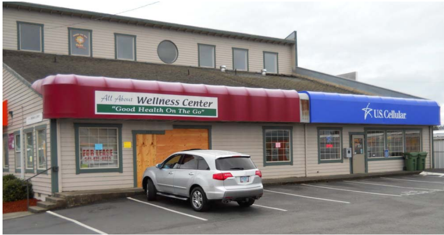
Little Caesars 789 South Broadway