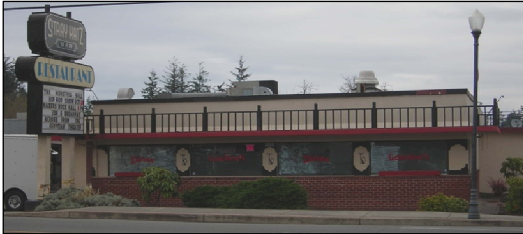
Beijing Restaurant 1090 Newmark Avenue