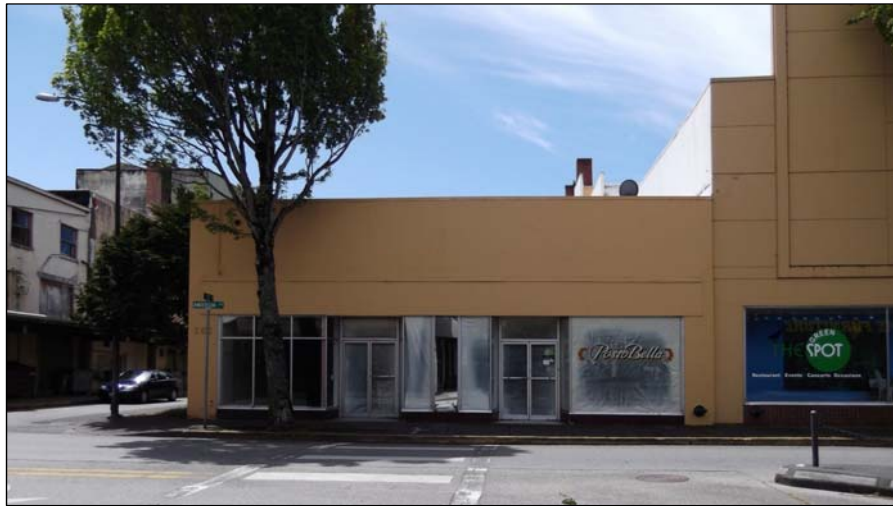
First Call Resolution 161 Anderson Avenue