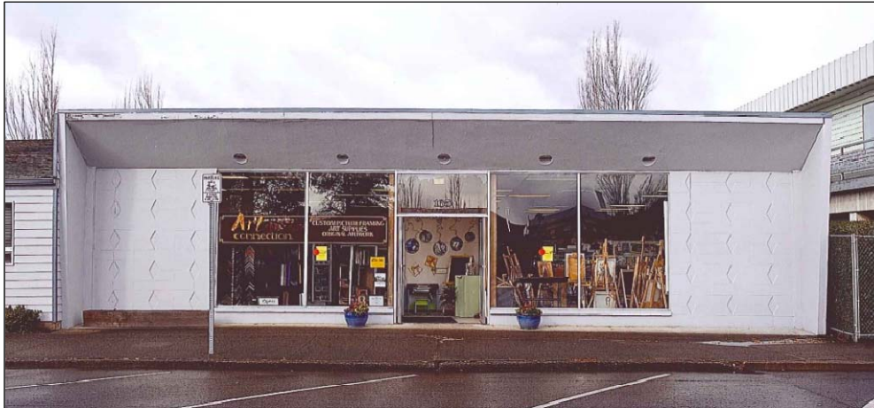
Webster Building / Art Connection 165 South 5 th Street