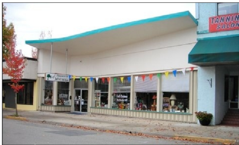
Rifkin Building 175 South 3 rd Street