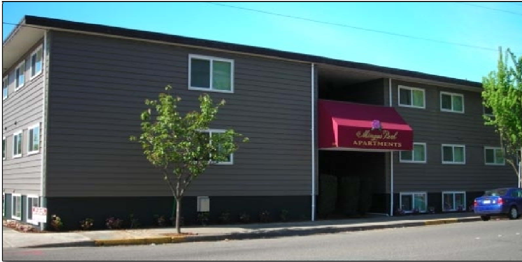
Mingus Apartments 503 Commercial Avenue August 2007