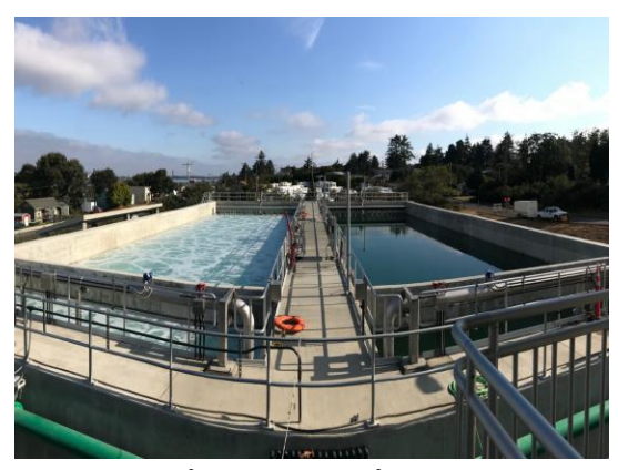
Newly Constructed WWTP2

The City has the largest lift station on the Oregon coast Constructed in 2016. In 2020 2 lift stations were fully upgraded. Currently 4 pump stations are under design for full upgrades.