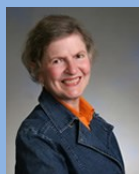
Mayor Crystal Shoji