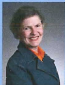
Mayor Crystal Shoji