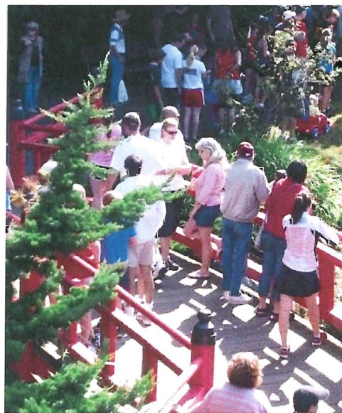
"Runners gather for the July 4 th run in Mingus Park"