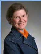
Mayor Crystal Shoji