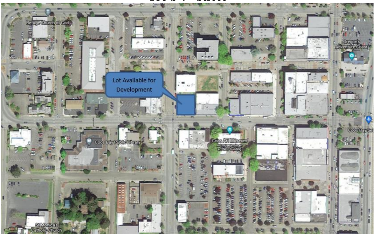
Figure 1 – Aerial of property