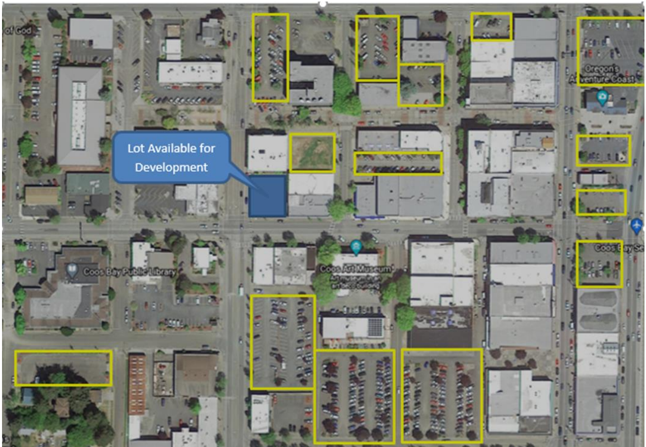
Figure 2 Downtown Coos Bay Public Parking Lots closest to site.

VII. Property Surroundings and Resources. Downtown Coos Bay is home to City Hall, the Coos Art Museum, Seven Devils Brewery, multiple dining establishments, the Coos Bay North Bend Visitors Convention Bureau, Coos Bay Downtown/Main Street Association, the World Newspaper, many administrative and retail businesses, secondary housing above second floors of commercial buildings and some stand-alone apartments.